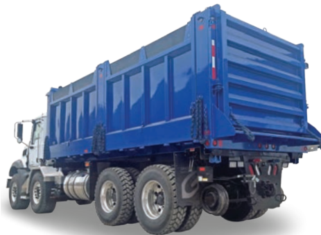
CUSTOM DUMP BODIES