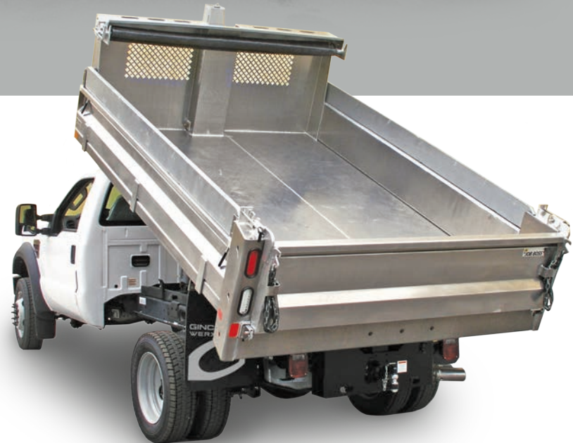
ALUMINUM DUMP BODIES