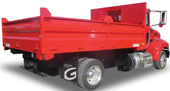
CONTRACTOR DUMP BODIES