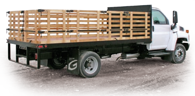
STAKE AND RACK ACCESSORY