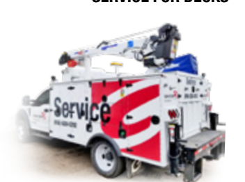
MOBILE SERVICE NORTHERN AND