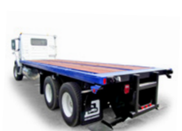
SERVICE FOR DECKS