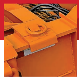
Hendrickson 250U Suspension