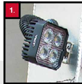
1. Dual rear mounted LED lights for bright illumination during low light or night operation.