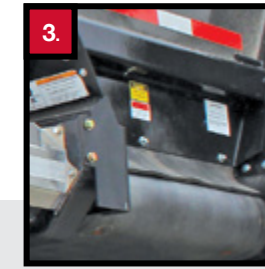
3. Equipped with Continental heat and oil resistant belt.