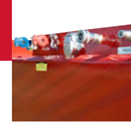
Standard Wetline Hook-Up And Controls