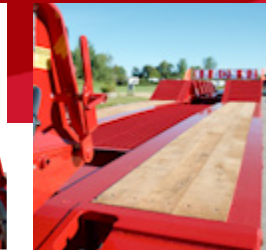
2 1/4" Oak Planks