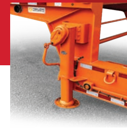
Holland Landing Gear