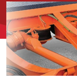
Hendrickson 250U Suspension